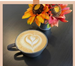
A PLACE TO BELONG