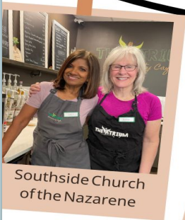
Southside Church of the Nazarene