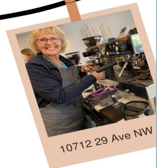
10712 29 Ave NW

TUESDAYS AND WEDNESDAYS 9:30AM to 2:30PM